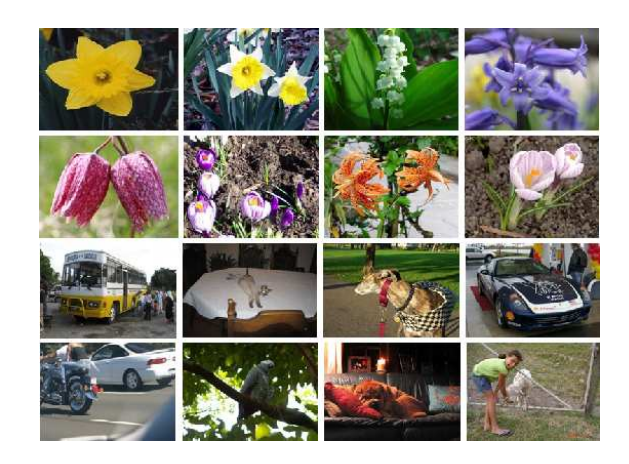
Figure 4: Example from the two data sets The top two rows show images from the Flower data set and the bottom two rows provide examples from the Pascal VOC 2009 data set.

Implementation Details: In our experiments we use the detectors proposed in section 2 together with a multi-scale Grid. The SIFT descriptor is used to create a shape vocabulary and the Color Names and HUE descriptors are used to create color vocabularies. We abbreviate our results with the notation convention CA (descriptor cue, attention cues) where CA stands for Color Attention based bag-of-words. In our experiments we use a standard nonlinear SVM with a \chi^2 kernel for the Flower data set and intersection kernel [4] for the Pascal VOC 2009 data set since it requires significantly less computational time, while providing performance similar to that using a \chi^2 kernel. We tested our approach on two different and challenging data sets,