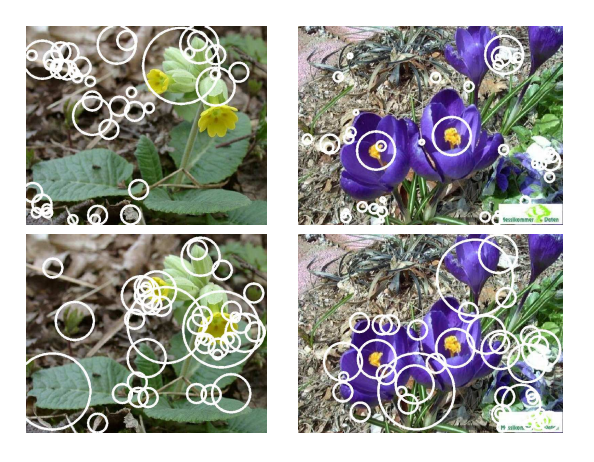
Figure 1: Top row: Laplacian-of-Gaussian and Harris Laplace based on luminance. Bottom row: Laplacian-of-Gaussian and Harris Laplace based on color boosting. The color boosted detector focuses on the more informative features. Only the fifty strongest detected regions are depicted. The radius of the circles indicates the scale selected.

The aim of feature detection is to find discriminative regions in images. Most existing methods only use the shape saliency as a criterion for detection, which is extracted from the luminance information. However the use of color information could lead to the detection of