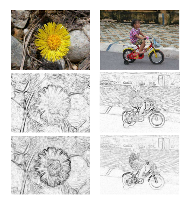
Figure 3: Comparison for edge detection. Top row: Original images. Middle row: RGB color edges. Bottom row: color-boosted edges. RGB edges are more biased by luminance.

proach to extend existing detectors to color is to compute the derivatives of each channel separately and then combine the partial results. However, combining the first derivatives with a simple addition of the separate channels results in cancellation in the case of opposing vectors, and the same situation occurs for second-derivative operators. To overcome this problem, Di Zenzo [13] proposed the color tensor defined as